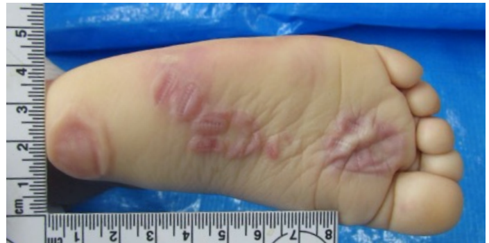
A child's foot with burns from a cigarette lighter.