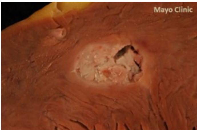
A. A heart with multiple abscesses, later proven to be Aspergillus.