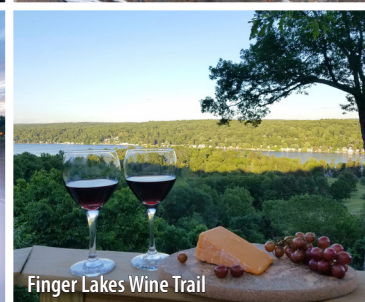
Finger Lakes Wine Trail