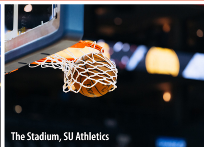
The Stadium, SU Athletics