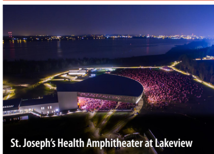
St. Joseph's Health Amphitheater at Lakeview