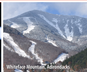
Whiteface Mountain, Adirondacks