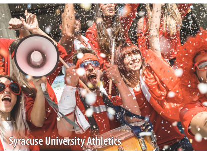
Syracuse University Athletics