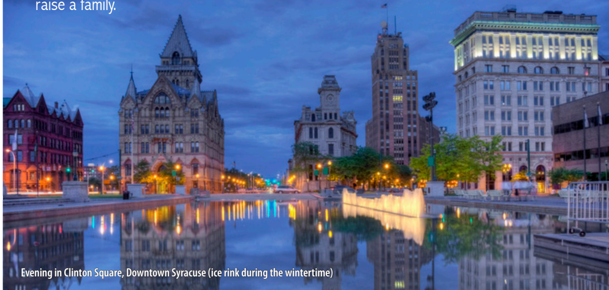
Evening in Clinton Square, Downtown Syracuse (ice rink during the wintertime)

From tech, the arts, cultural events, and beautiful natural surroundings to sports and seasonal outdoor activities, Onondaga County is a great place to live, work, play, and raise a family.