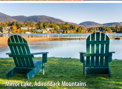
Mirror Lake, Adirondack Mountains