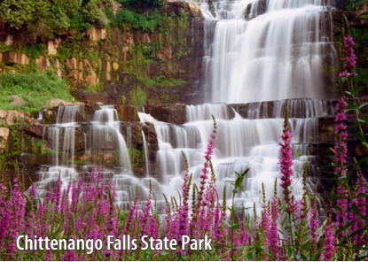
Chittenango Falls State Park