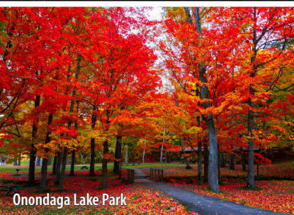
Onondaga Lake Park