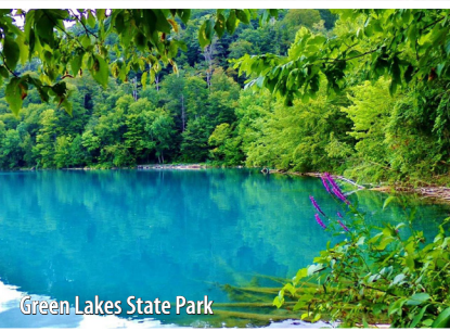
Green Lakes State Park