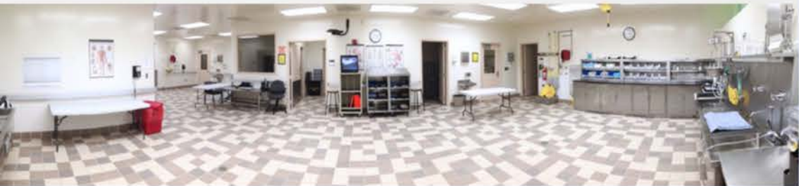
DEKALB FORENSIC LABORATORY SUITE

To apply, candidates must be M.D. or D.O. graduates with a completion of an anatomic pathology residency and be a US Citizen, US Resident, or have a J1-Visa