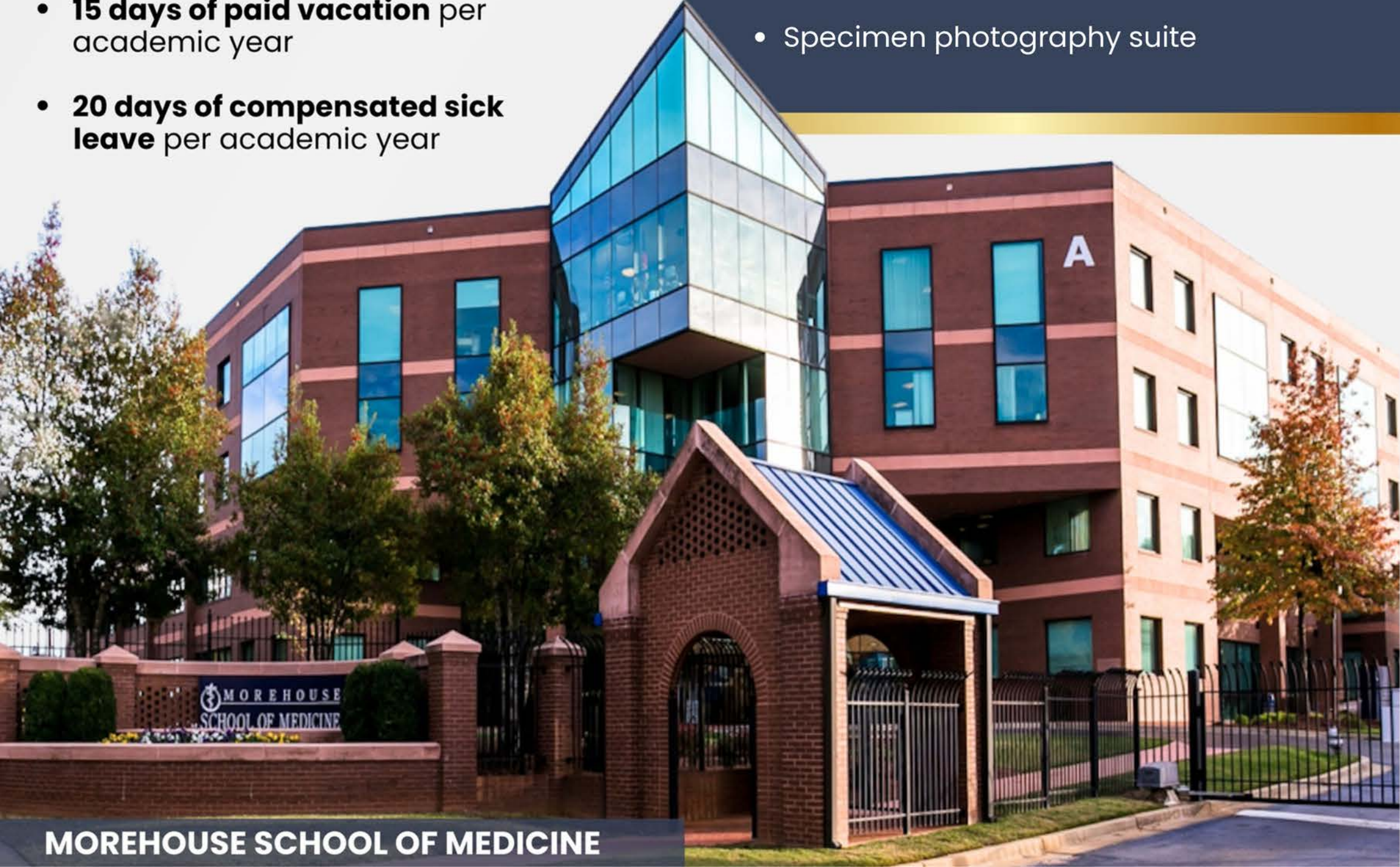
MOREHOUSE SCHOOL OF MEDICINE