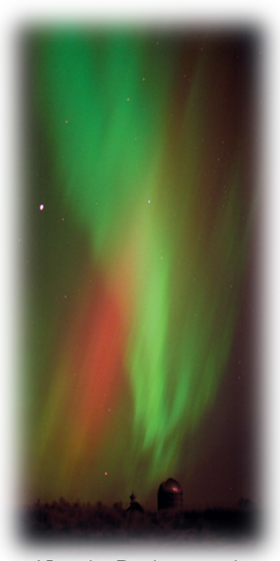
North Dakota -shine like the Auroras