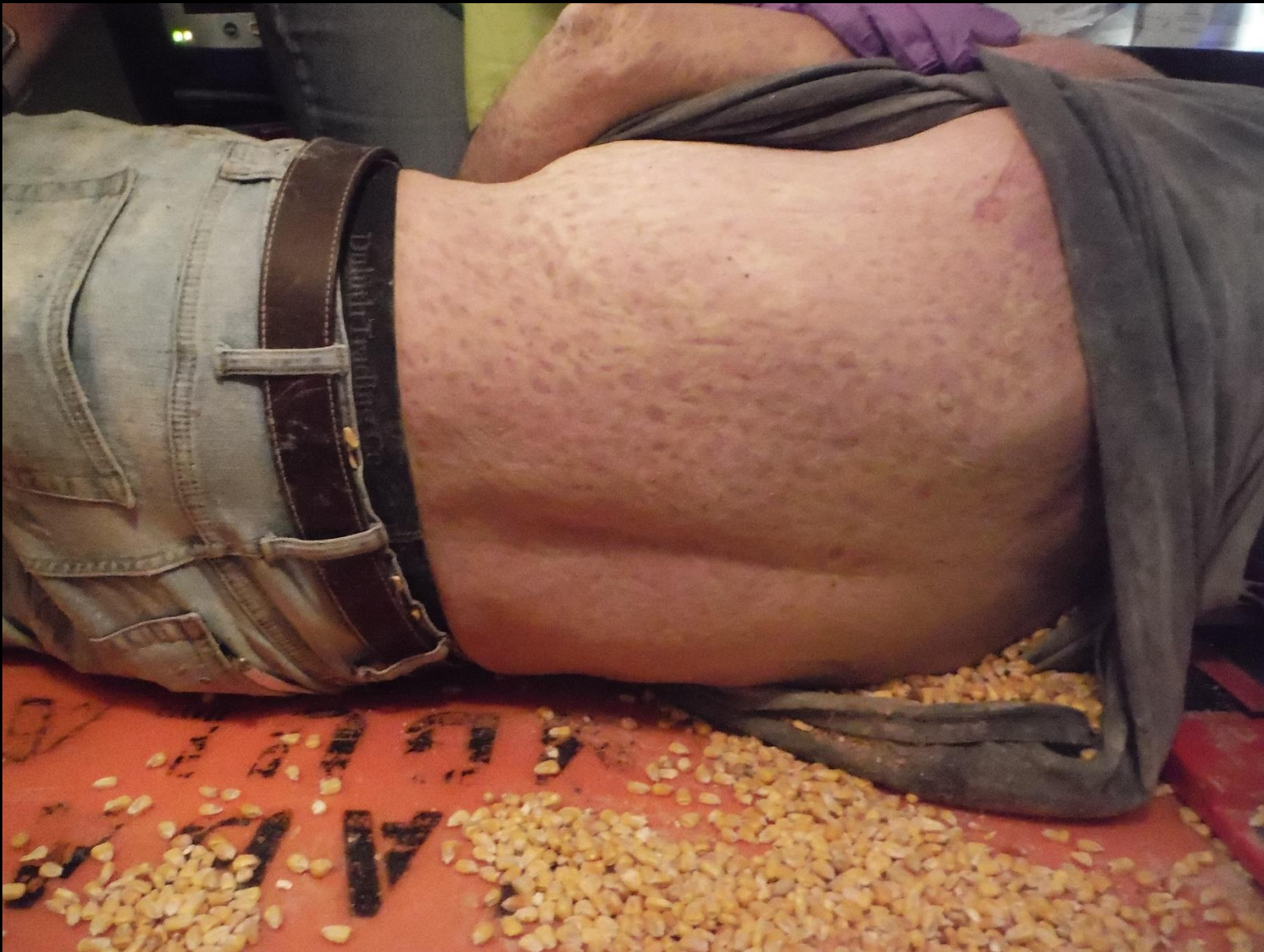
Corn kernel imprints on the decedent's back at the scene