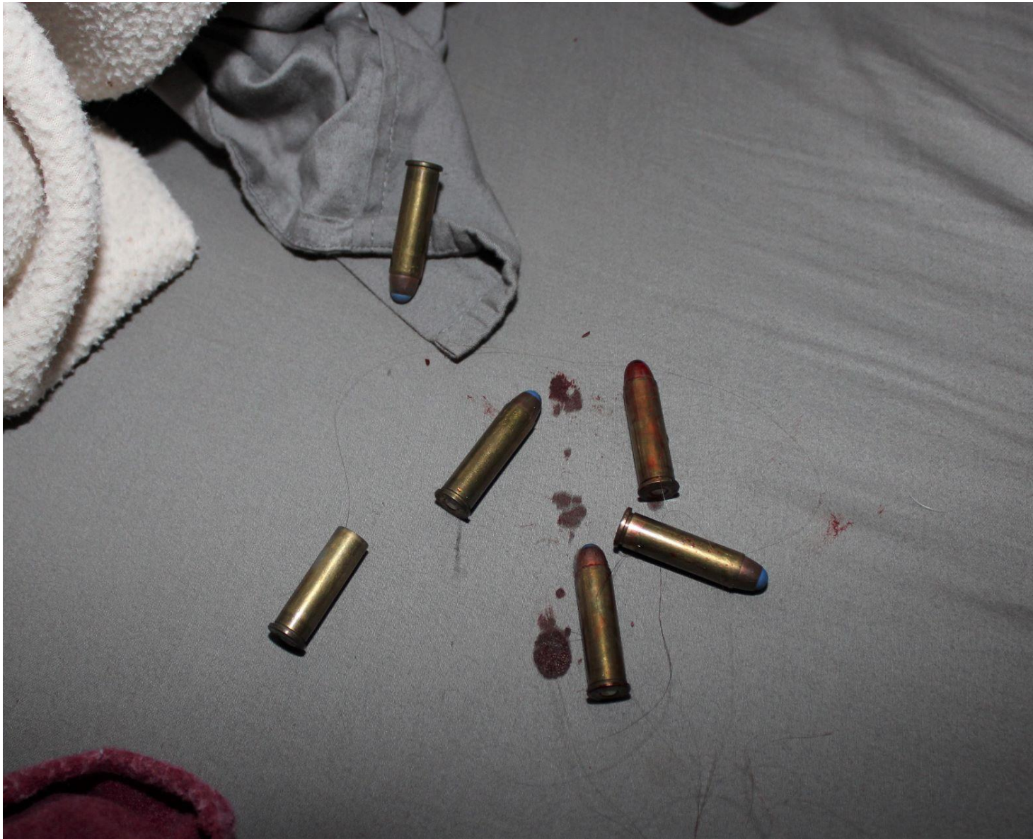
Bullets found at the scene