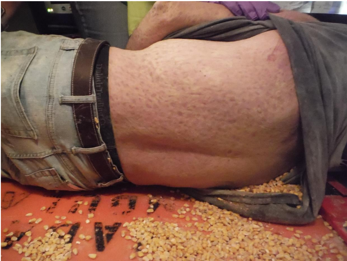
Corn kernel imprints on the decedent's back at the scene