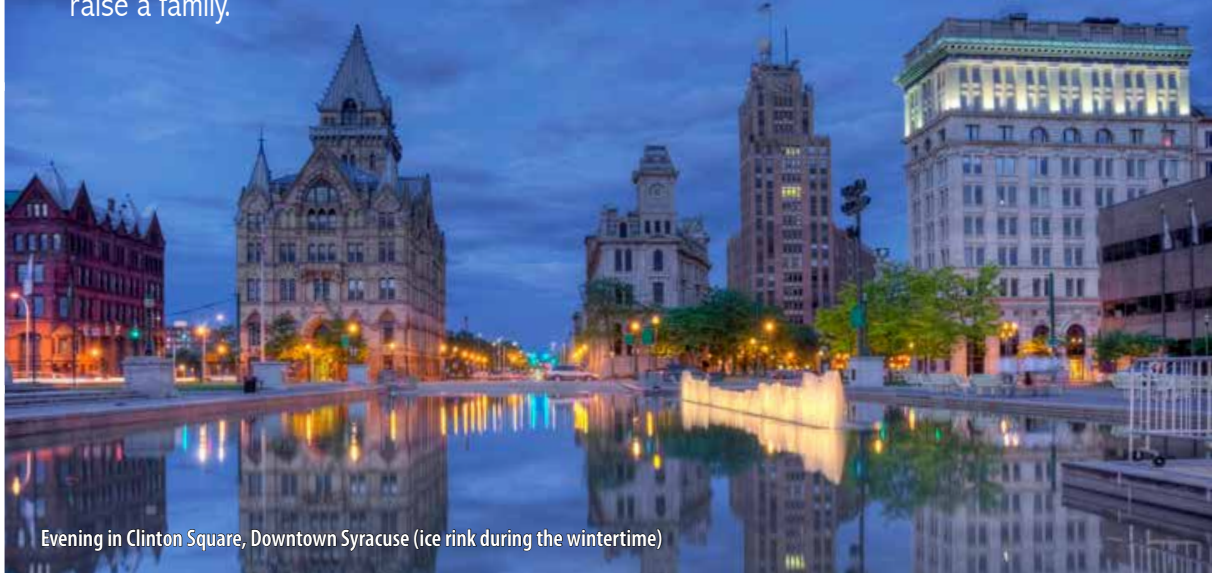
Evening in Clinton Square, Downtown Syracuse (ice rink during the wintertime)

From tech, the arts, cultural events, and beautiful natural surroundings to sports and seasonal outdoor activities, Onondaga County is a great place to live, work, play, and raise a family.