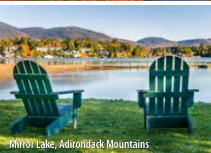
Mirror Lake, Adirondack Mountains