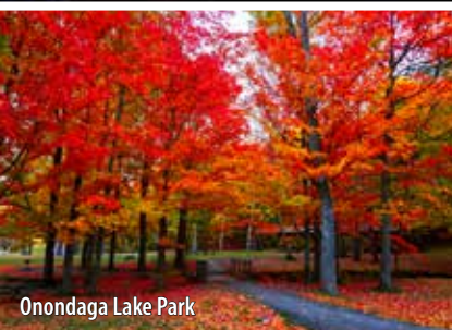
Onondaga Lake Park