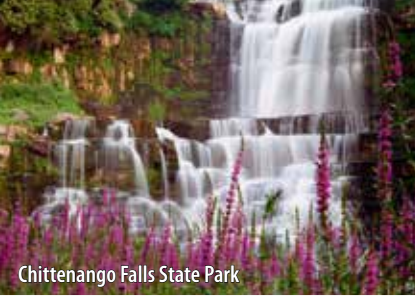
Chittenango Falls State Park