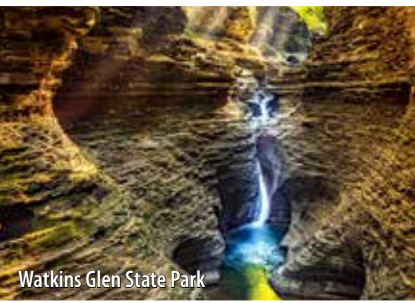
Watkins Glen State Park