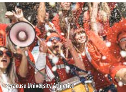
Syracuse University Athletics