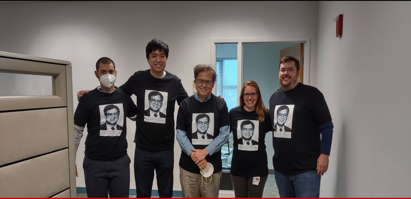
Honoring Dr. King