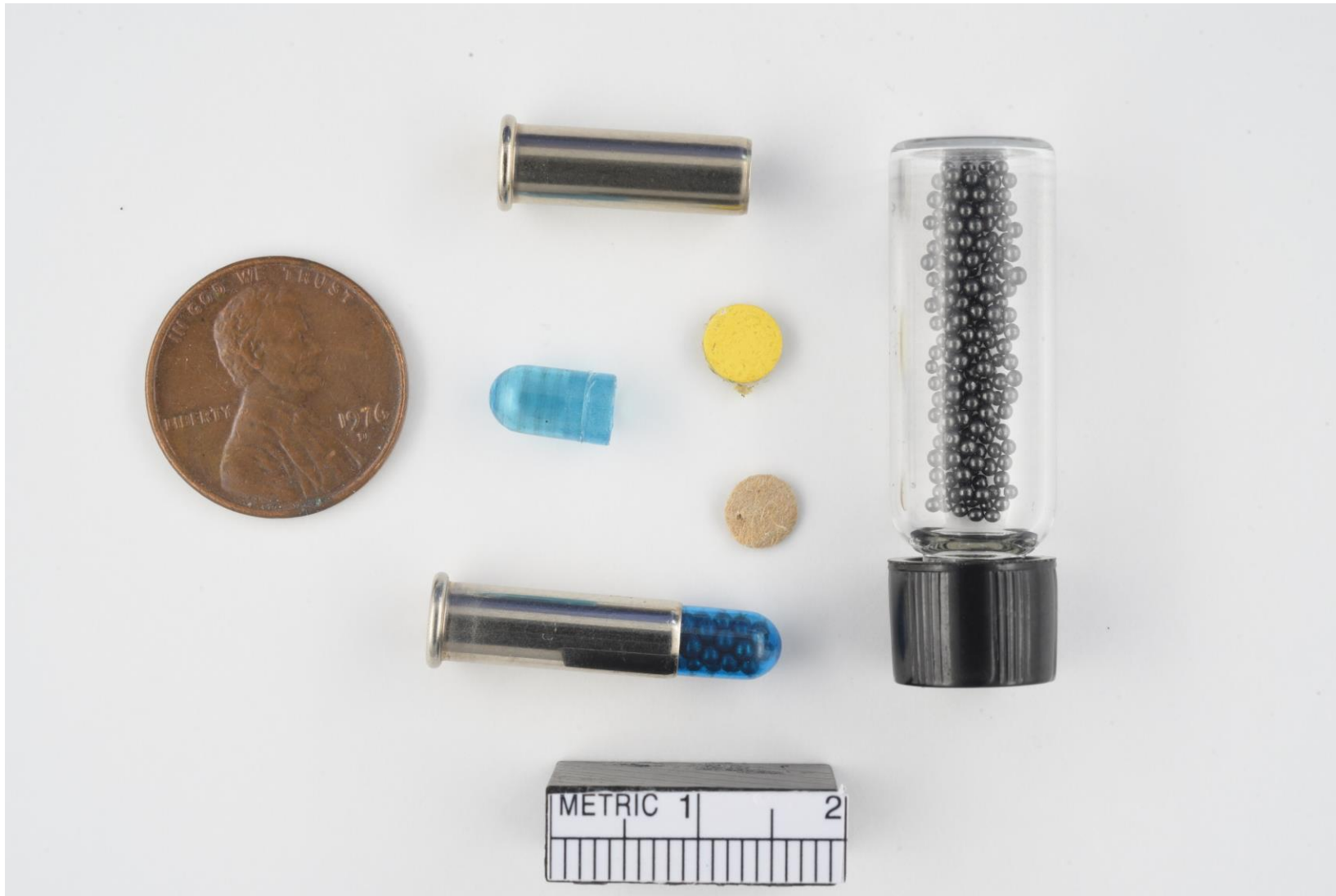
Example of small caliber (.22) snake shot ammunition broken into components including the plastic cap, shot, and small cardboard wads.